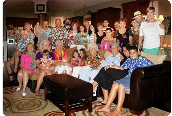
Granny's 90th birthday with the family.