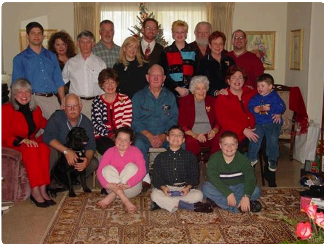
Christmas 2002 with the family.